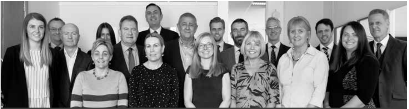
Pictured: The Team at Kellands (Bristol) Limited